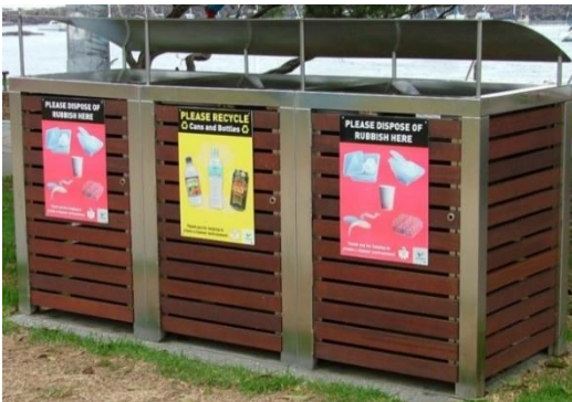
EM235 240L triple unit with custom angled hood & pins options (client-affixed signage)