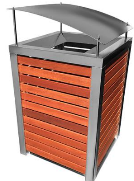
EM235 240L with angled hood and pins options