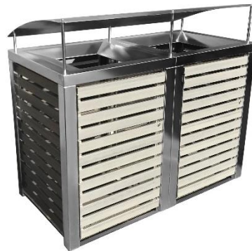
EM235 240L twin unit, custom angled hood & pins with composite timber battens options